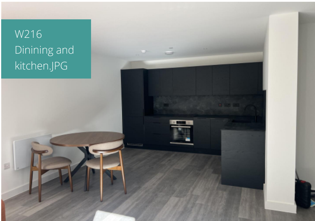
W216 Dining and kitchen.JPG